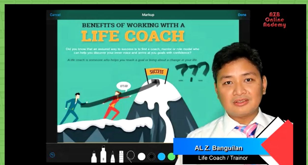
Using Tablet/iPad as your Background