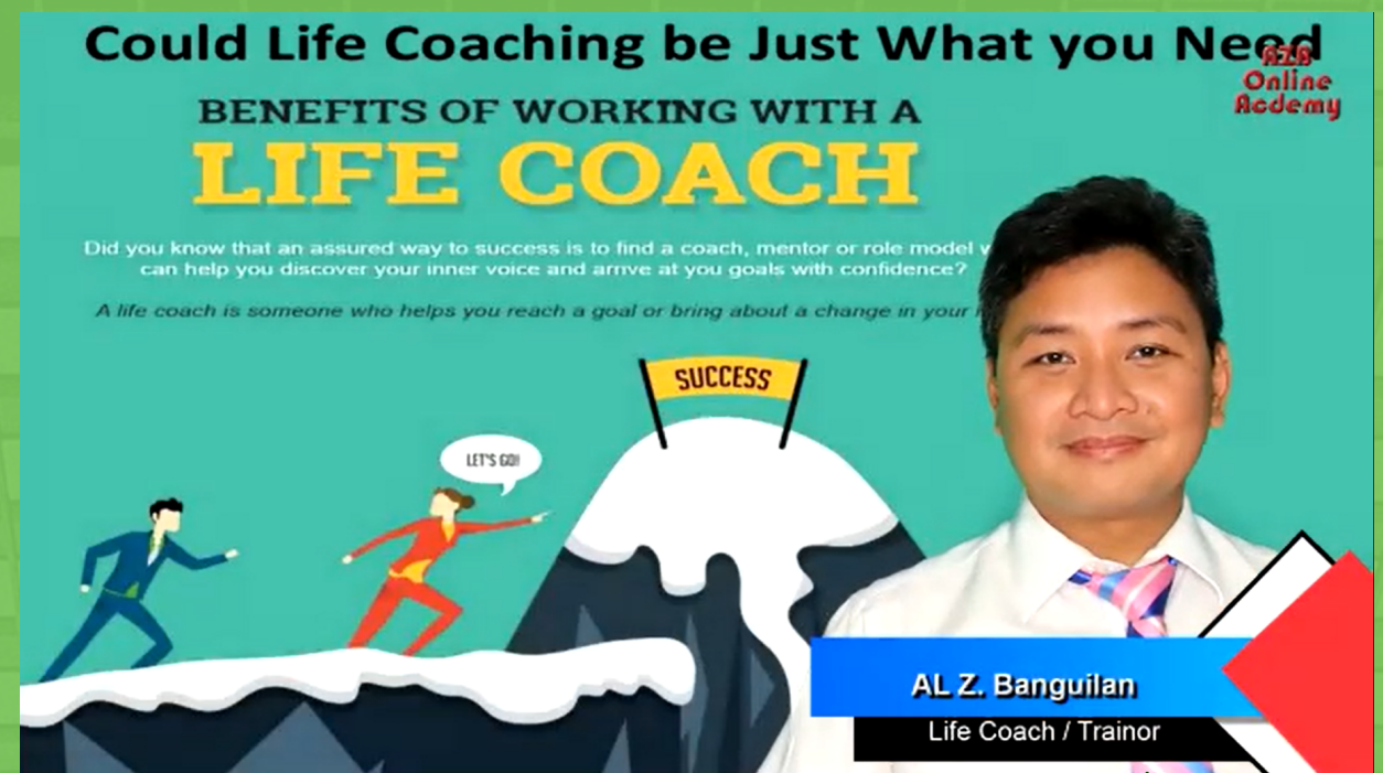
Your Poster as background with Logo and Name/Title