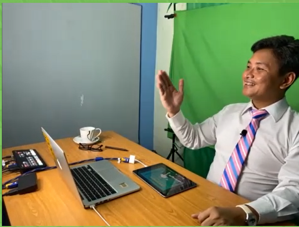
Behind the Scene

PROFESSIONAL KIT STARTS AT PHP 109,995.00