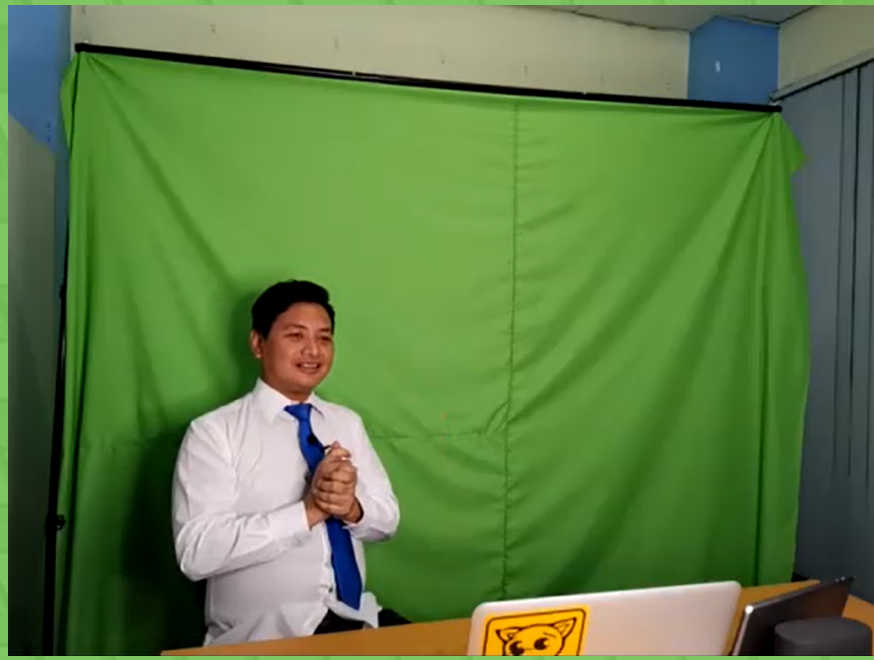
Behind the Scene

PROFESSIONAL KIT STARTS AT PHP 109,995.00