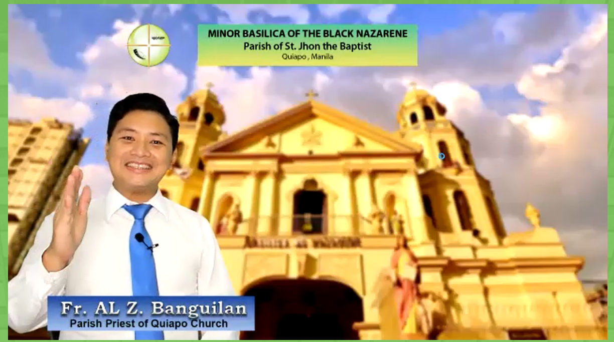
Use Church as your Background with Logo and Title