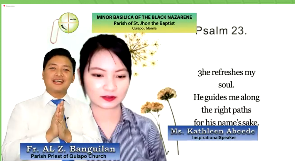
Live Remote Guest as your Background