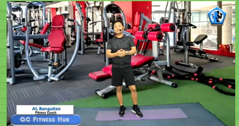
FITNESS TRAINERS / GYMS