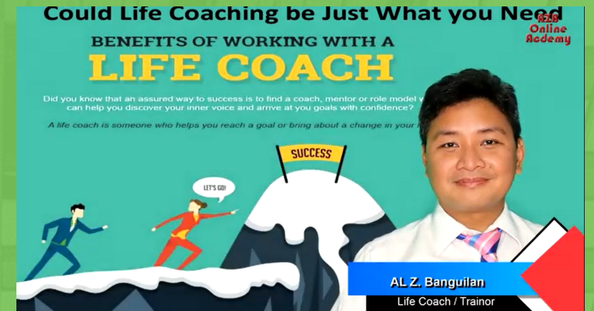
TRAINERS / COACHES / PUBLIC SPEAKERS