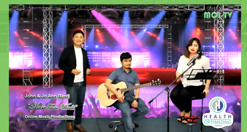
LIVE PERFORMANCES /EVENTS